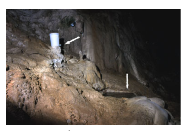
Figure 4. Drip pool 5 in Škocjanske jame modified to be a permanent water source. Arrows indicate the drip with a filtration unit underneath and the pool, offset from the drip.

Based on a Cochran-Mantel-Haenszel test, there was strong evidence of an association between copepod maturity and water source, after adjusting for cave ( \chi^2 = 75.76 , df = 1, P < .0001), for the 37 samples with non-zeros for drips and pools. The probability of a copepod in a drip being immature was 2.08 times higher than the probability of a pool copepod being immature, with a 95% confidence interval of 1.73 to 2.50. Table 4 lists all eight cases of paired drips and pools over a 60 day sampling period for which the total abundance of copepods (immature and mature) collected was greater than 10 in each habitat. In five of the eight individual cases, the frequency of immature individuals in drips was significantly greater (Fisher's exact test) than in pools, two were not significant, and only one anomalous case was found — that of pool 5 in Škocjanske jame, where the frequency of immature individuals in pools was higher than in the associated drips. The frequency of immature individuals in Skocjanske jame pool 5 was always higher than in the associated drip, the only pool for which this was the case. Unlike all of the other drip pools in the study caves, pool 5 had