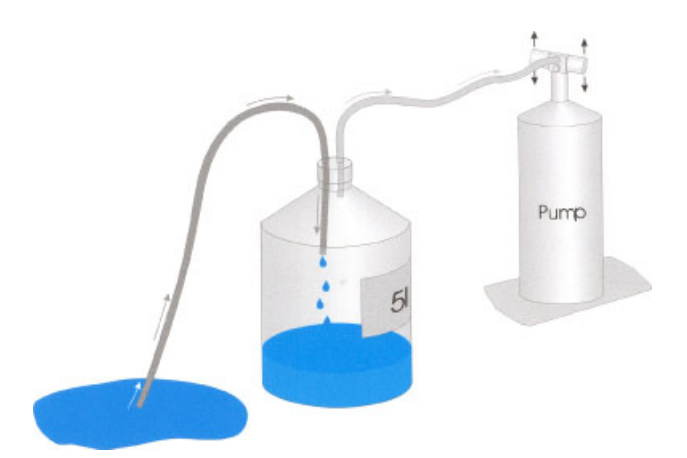
Figure 2. Apparatus for aspirating water in pools. After aspiration, the water and sediment mixture in the container is passed through a filtering bottle for preservation.

samples were combined into 3-month samples that correspond to the interval between pool samples.